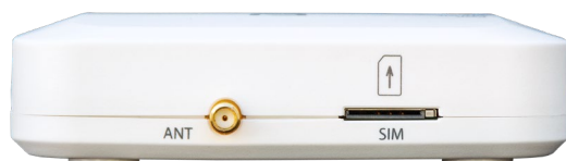
DIGI CONNECT® IT MINI LEFT