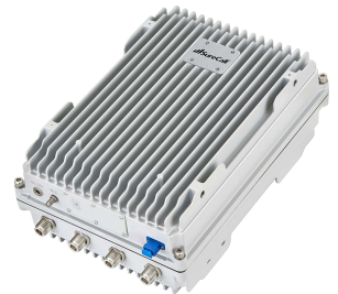
SignalMax Fiber DAS Cellular System for Large Enterprise Buildings